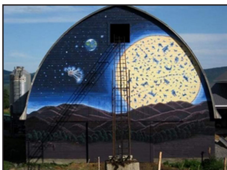
Jasper Hill Farm prior to vandalism

We had a fantastic opportunity to bring our racial justice educational programs to the Northeast Kingdom as the silver lining to the horrific, racist vandalism that occurred in the Glover-area in summer, 2017. In response to the harmful slurs and symbols spray painted on their gorgeous barn (and other places), folks at Jasper Hill Farm collected money to reward anyone who helped find the perpetrators. The funds weren't needed for that so instead the community agreed to contract the Peace & Justice Center