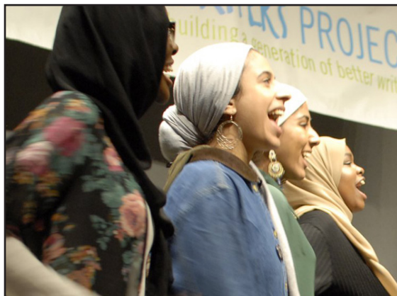
Muslim Girls Making Change at Ed Everts Activist Awards Celebration

Mission: We work on the interconnected issues of economic and racial justice, peace, and human rights through education, advocacy, training and nonviolent activism, and community organizing.