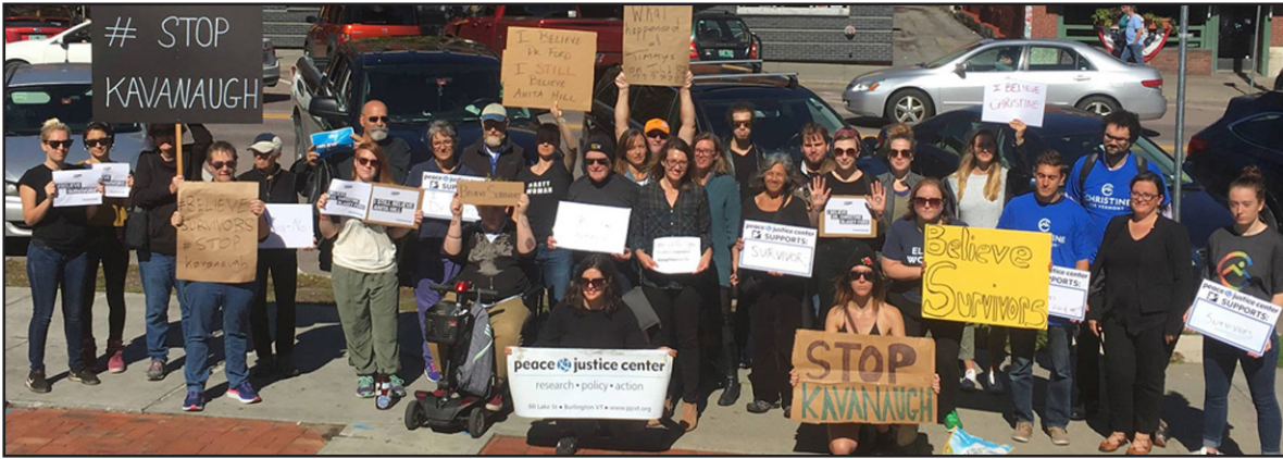
Stop Kavanaugh / Believe Survivors protest

Thanks to the generosity of the Possibility Shop at the First Congregational Church in Burlington, we are well stocked on PJC t-shirts now for both store sales and to give our volunteers. (We buy them used and get them screen printed locally.) We have our own water bottles, totes, mugs, and sporks – all of which meet our purchasing policy standards.