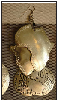
Denur Crafts earrings

pieces, slat wall, and a new floor plan configuration have made things more functional, accessible, and tidy. We have new sandwich board signs and a feather flag that are helping to attract more foot traffic. One of our vendors, Denur Crafts , a women's cooperative based in Nairobi, Kenya, was founded with a goal to send 100 kids to school. This year, through the soapstone figures, jewelry, and other products that they make and we help sell, they made that goal! Now they are working to send three kids to college.