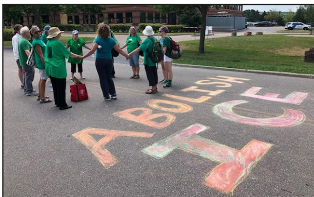
Civil disobedience in front of the ICE office in Williston

When the Trump administration called for zero tolerance at the Mexico-US border and the separation of children from their families skyrocketed, we were called to action to resist family separation and protest the inhumane policies of ICE . We supported a dozen protests statewide and into New York State. One of the protests, outside the ICE offices in Williston, included the arrests of 13 people, two of them minors, for civil disobedience. The court cases continue and the PJC continues to help shine a light on this issue and help people take action.