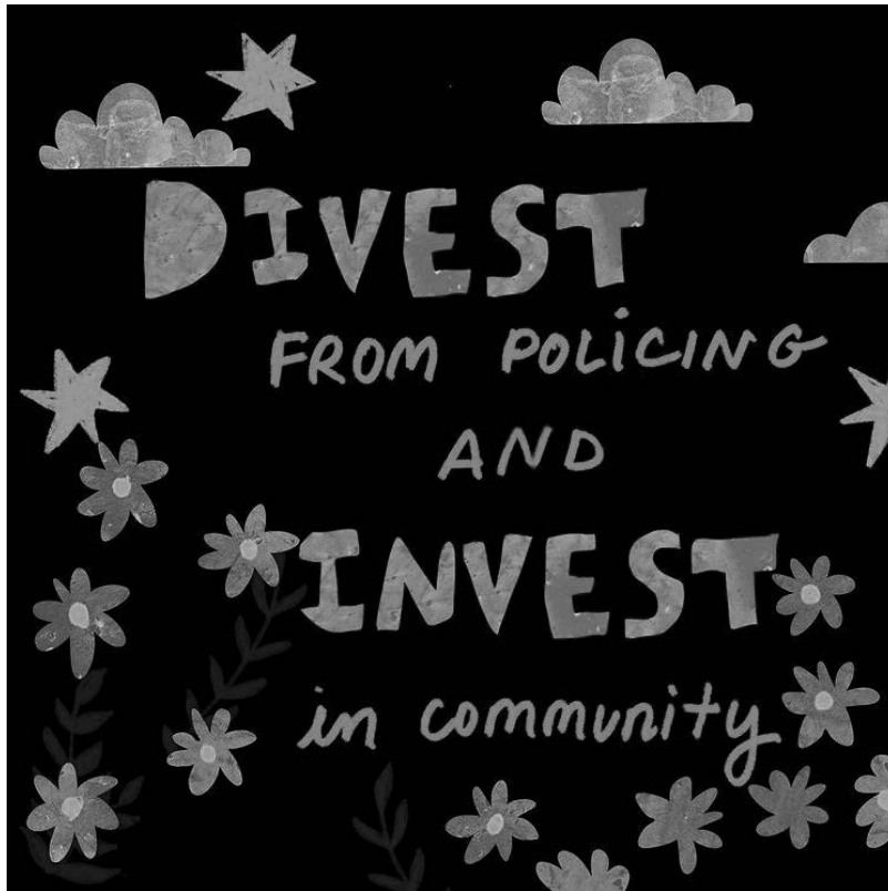
Artwork by Nina Yagual @beautifulhoodcrumb