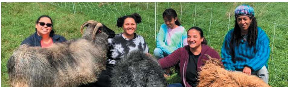
PJC BIPOC retreat at Knoll Farm, July 2020