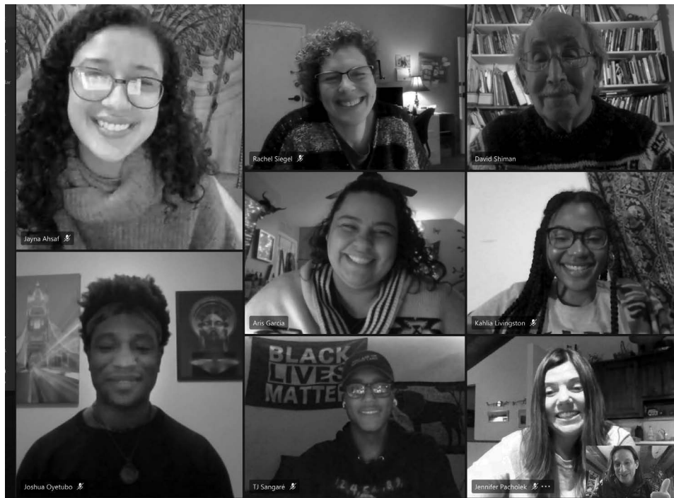
PJC Board of Directors after voting to add healthcare to staff benefits in January.

Lastly, I want to be clear, I am leaving this role at the PJC but I am not leaving this work. Although, because of my points of privilege I am not the best suited to lead this work, I am needed. We are all needed.